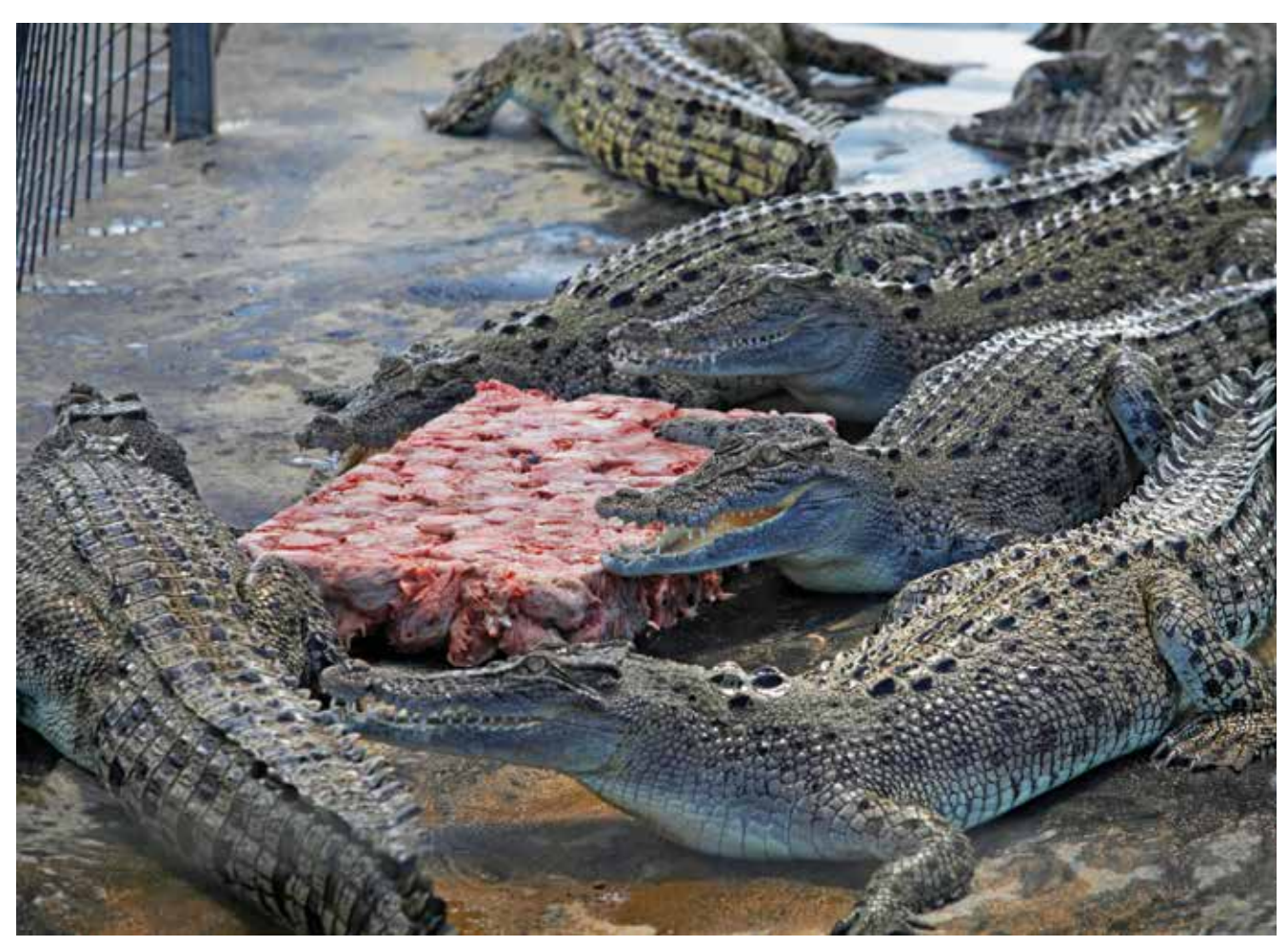
Image: Feeding of sub-adult crocodiles in a communal farm enclosure.

the most recent studies are 15 to 16 years old. It is therefore totally inadequate to uphold the minimum standards for best practice farming for crocodile welfare in 2021. The Code acknowledges its own limitations stating it is '... based on current knowledge about crocodile welfare issues and what is currently 'thought to be best practice' in humane handling techniques<sup>27</sup>. It adopts a "precautionary approach in the light of incomplete knowledge.' The Code states gaps in knowledge of physiology, behaviour, pain thresholds of crocodiles and the need for further research to improve humane treatment (i.e. to minimise pain and suffering). It also makes no reference to quality of life for the farmed animals. The Code states that it will need to be modified as new information comes to light: "..research into all aspects of captive husbandry is needed and is progressing rapidly around the world. This may alter current husbandry practices and policy"27. That this was written 12 years ago is concerning.