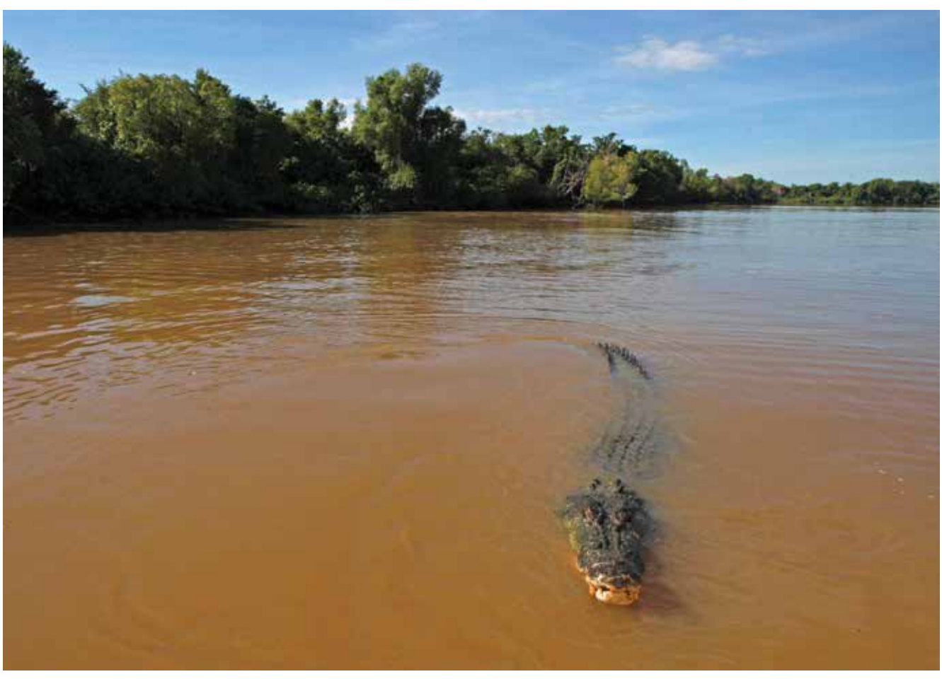
Image: A wild crocodile swims in the Adelaide River, Northern Territory.

Crocodiles are cold-blooded, relying on the external environment to regulate their body temperature. This involves moving in and out of water, basking on land, shade seeking and mouth gaping. Their behaviour is subtle - although they spend large amounts of time motionless, they are often alert watching their environment. They have highly developed vision, hearing and sense of smell allowing them to probe their surroundings<sup>18</sup>. Crocodiles have dominance hierarchies and males are territorial. Females use elevated, shallow sites for their nests which they defend. They are opportunistic predators that ambush their prey then drown it. Prey includes fish, goannas, birds, cattle, buffalo and wild boar. Saltwater crocodiles are one of the most aggressive species of crocodilian with the least tolerance of conspecifics (i.e. being in close proximity to other crocodiles)<sup>19</sup>.