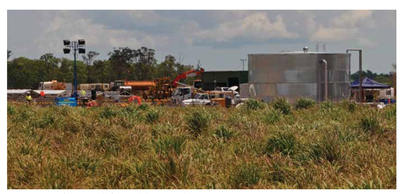
Image: Construction of the new crocodile farm at Lambells Lagoon, Northern Territory.

Hermès bags are often made to order, with desktop research showing that they can sell for over US$300,000 for a rare Birkin bag. In contrast, crocodile handbags locally made and sold in Australia sell for closer to AU$2,000.